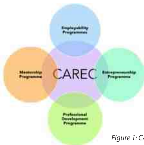
Figure 1: CAREC Strategic Programmes

All relevant communications from the Team are disseminated across these groups as well as the community platform.