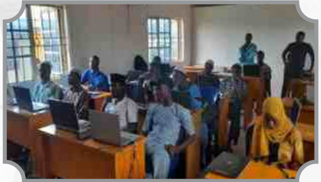
Figure C2: The renovated classroom/lab