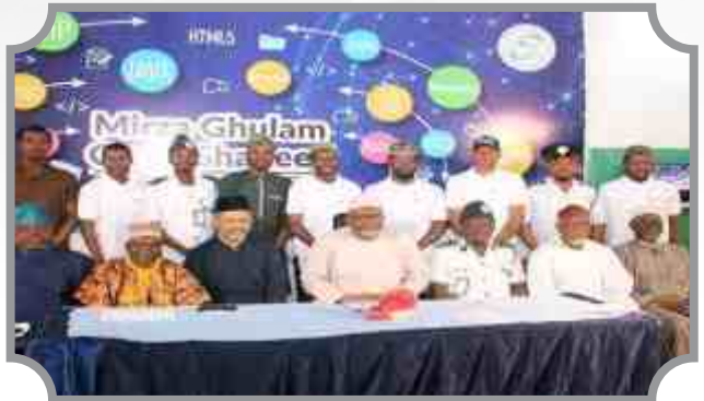
Figure D2: some members of the management/instructors, and invited guests