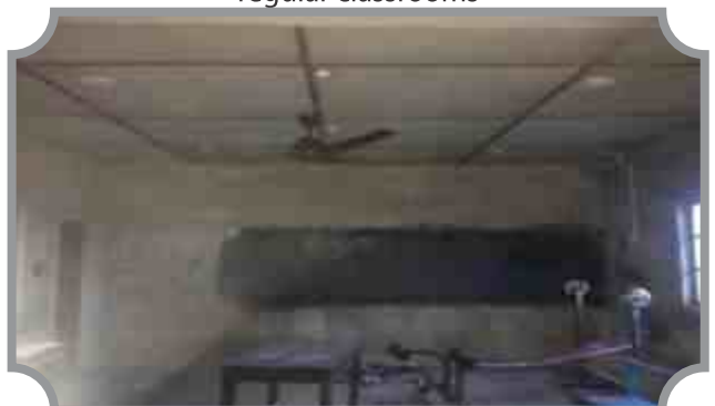
Figure B1: The new classroom/lab before renovation