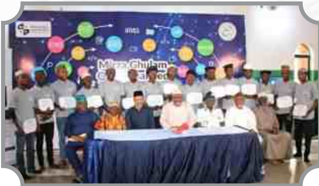
Figure D1: Graduands of the second cohort and invited guests