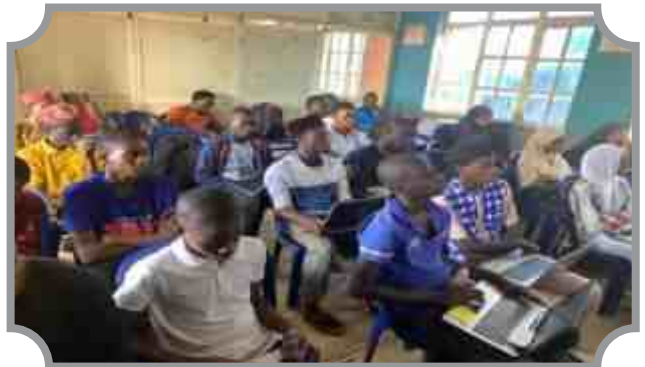
Figure A2: Classes being held in one of the school regular classrooms