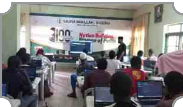
Figure A3: Classes being held at the Lajna Hall