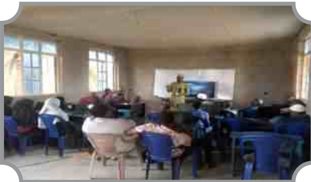
Figure A1: The proposed school hall