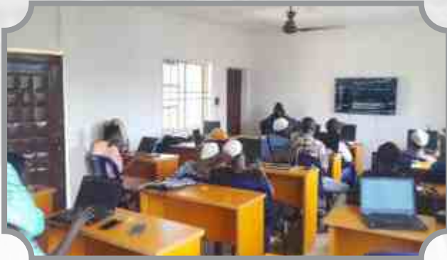
Figure C1: The classroom after the facelift